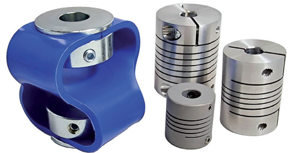
A Photograph Example of our Coupling Selections

The Primary job of couplings is to join together two pieces of rotating equipment while permitting some degree of misalignment or end movement or even both. By careful selection, installation and maintenance of couplings, substantial savings can be made in reduced maintenance costs and downtime and will help prolong your equipment's life.