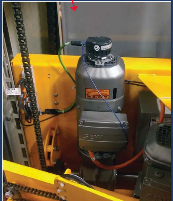
This installation required a hollow bore to go over the shaft. The Model 25H was the perfect solution.