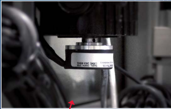
The compact Model 15T fits into tight spaces, but still delivers high performance.