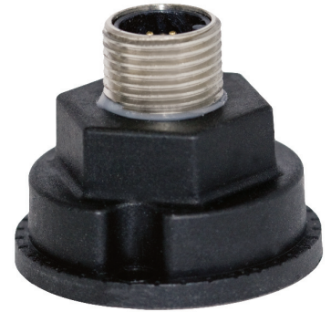
A magnetic encoder module. Just 30 mm in diameter, this module has an M12 connector that affords it an IP69K seal.