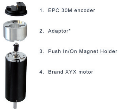
In this mounting option, a magnetic encoder module is coupled with a magnet holder that pushes onto the shaft.

Contact BEPC today and you'll talk to real engineers who can help you incorporate the 30M into your application.