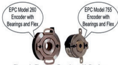
Figure 4 - Thru-Bore Encoders with Bearings

Optical encoders (such as BEPC's Models 755A and 260) usually include internal bearings. With bearings, the amount of axial play is typically controlled to less than 0.0005". In