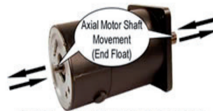
Figure 2 - Axial Movement of a Servo Motor

It can be difficult to obtain end float specifications from the motor manufacturer, and even when you do, the information may not be correct. Some motor designs mechanically lock the shaft's axial