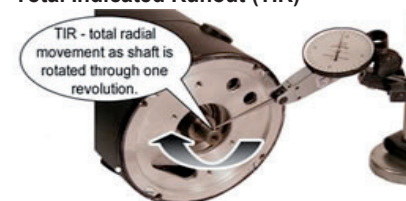
Figure 3 - Total Indicated Runout

Total Indicated Run-out (TIR) measures the radial range of shaft movement about its centerline (See Figure 3). If an encoder is to be mounted on the motor shaft, TIR