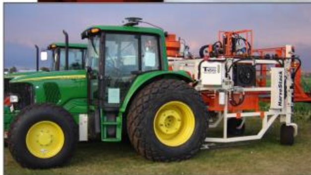
Flexible shaft-mounted Model 702 installed on agricultural harvesting equipment