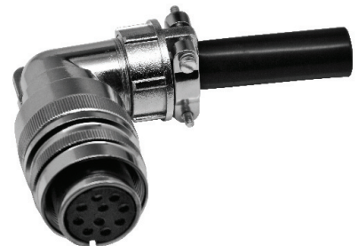
10-pin MS type