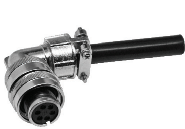
6-pin MS type

These installation instructions apply to all three 90° Connectors pictured below: