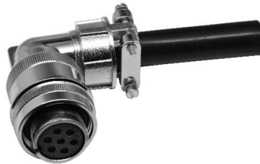
7-pin MS type