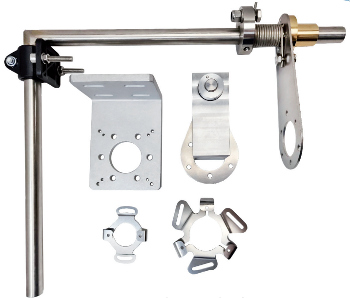
A Photograph Example of our some of our Selections

Below are charts showing a selection of our available fixing options, We also have a selection of options not shown here and can also offer modified versions to suit your individual needs to allow you to replace a competitors model with one of our own.